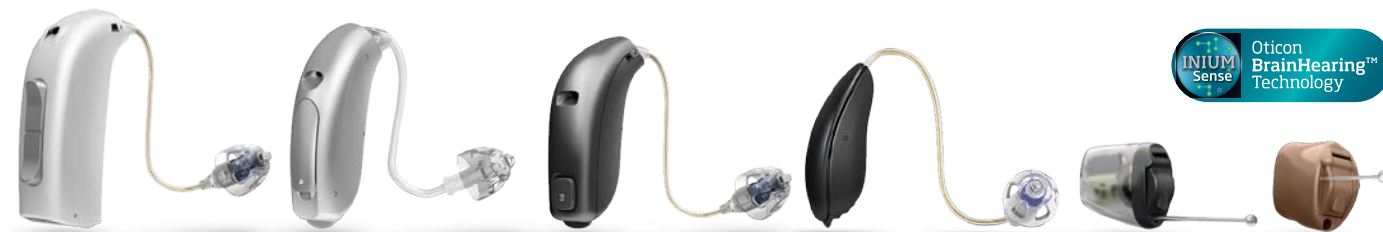
Hearing aids shown in actual size. Available in many different colours.